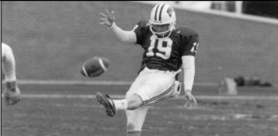
All-American punter Dave Zastudil owns the top four punting average games and seasons in Ohio history. He is the only player in Mid-American Conference history to lead the league in punting four times.